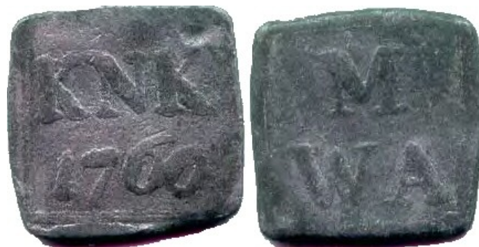
Eighteenth Century Kennoway communion tokens.

The Church at Kennoway's historic connections are recognised by it being a part of the new Fife Pilgrim Way.