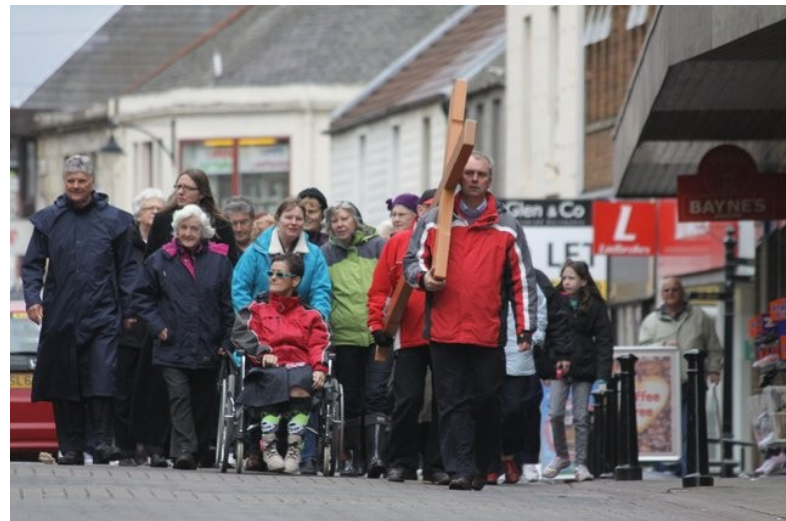
Levenmouth Churches Together Good Friday Walk of Faith