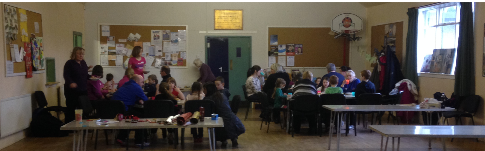
Mealtime at Messy Church