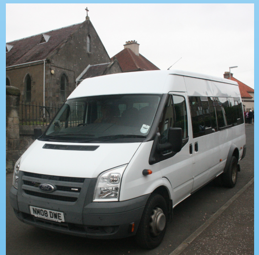
The Church minibus outside Windygates' Hall

The Churches are well used for wedding and funeral services and both buildings are used by local schools for their end of term services attracting a large number of parents and carers.