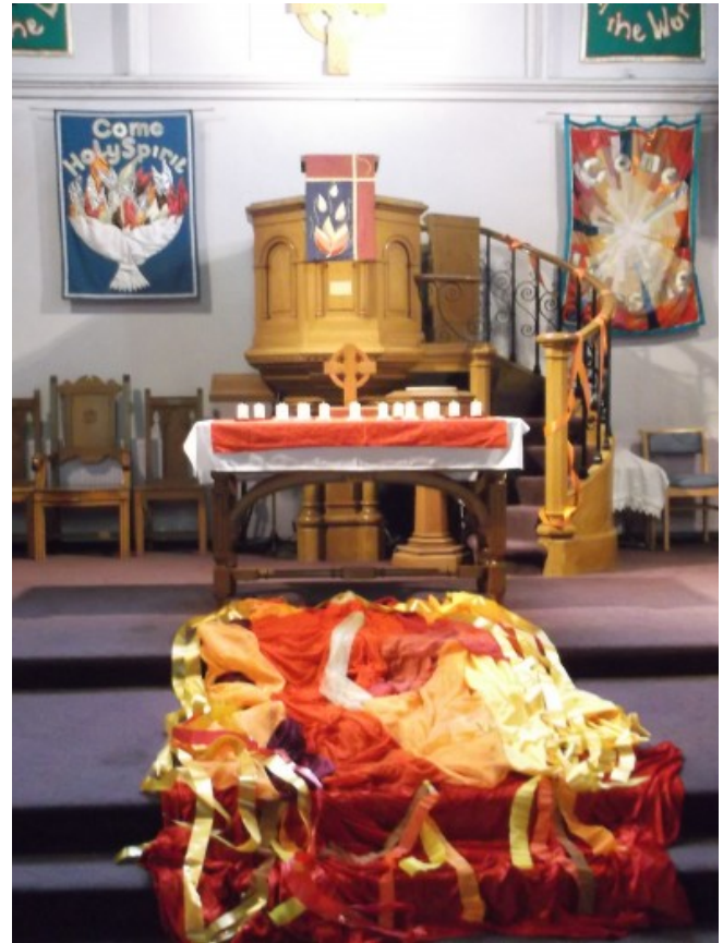
Soul Space - Pentecost

The Church office has an administrator, which is a permanent post, supported by a team of volunteers.