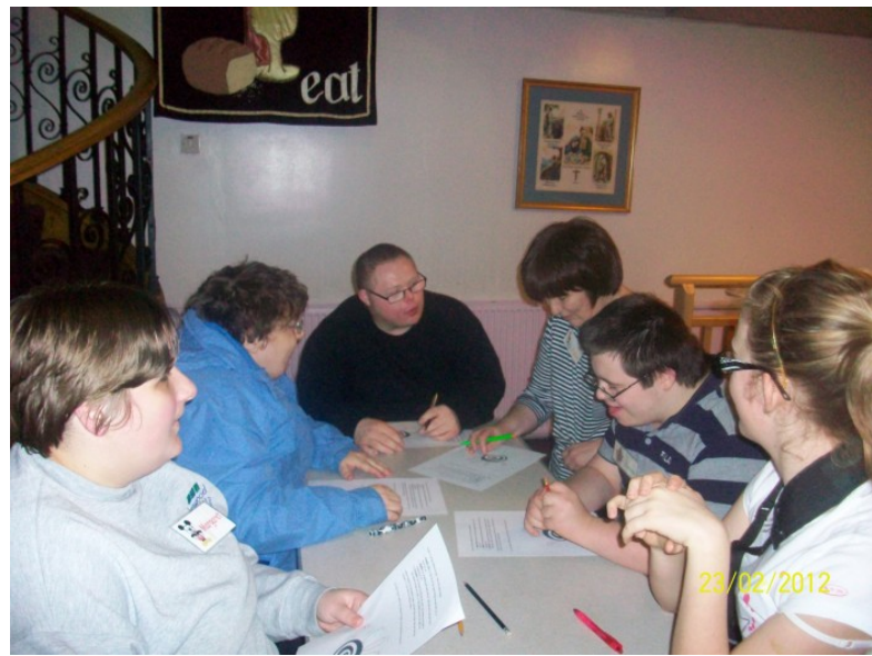
Welcome to Worship

Worship is complemented by a praise band which can be extended/expanded for special services. There has also been a 'pop up' choir which sang at last year's Christmas services in both churches.